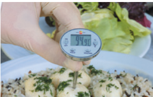
For temperature spot-check measurements in food production