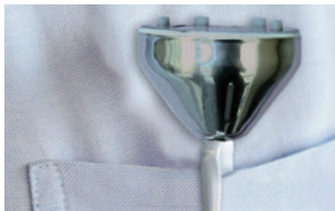
The protective sleeve with a clip holder. Always on you and ready to hand.