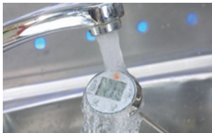
Simply rinse under running water when dirty.